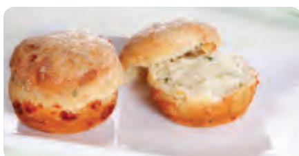
SAVOURY MUFFINS - $3.10 each Baked in-house and flavours may include cheese, corn and chive, olive and rosemary, semi-dried tomato and ricotta and spinach to name a few. (Available warm or cold)