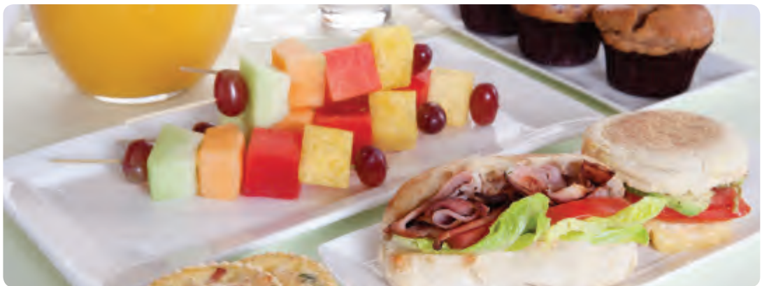
BREAKFAST PACKAGE TWO $15.90 per person Fresh fruit skewers, freshly baked sweet muffins, mini quiches, toasted English muffins and orange juice.

Order online at www.elizabethandrews.com.au