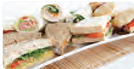
VARIETY PLATTER - $12.35 per person Includes a selection of Swiss cobb sandwiches, Kaiser rolls and wraps. Minimum order of 6.