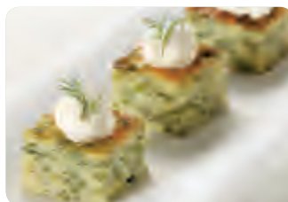
ZUCCHINI FRITTER V G - $2.90 each Zucchini and haloumi cheese fritter with a dollop of sour cream and yoghurt.