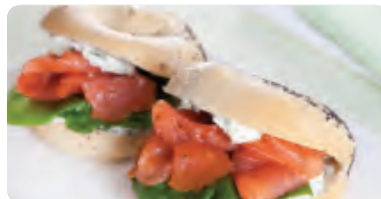
POPPY SEED BAGELS- $6.60 each Traditional with smoked salmon and dill cream cheese.