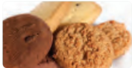
ASSORTED BISCUITS - $4.70 per serve An extensive range of classic and contemporary biscuits (3 per serve).