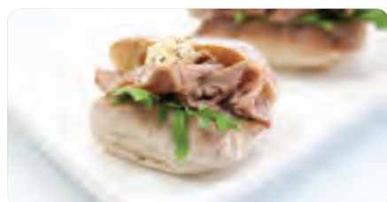
BABY BEEF ROLLS - $5.15 each Soft mini rolls filled with roast beef, rocket and béarnaise sauce.

A great alternative to sandwiches providing a real wow factor at your meetings. It is recommended to select 3 of these large cold savouries to make up your lunch, or combine them with a selection of sandwiches for a heartier meal. Minimum of 10 pieces per item