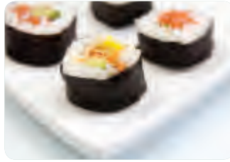
SUSHI - $3.60 per serve G A selection of sushi comprising vegetarian, seafood & chicken with soy sauce (2 per serve).