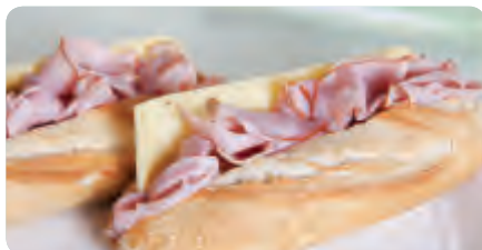
BREAKFAST BAGUETTE - $6.60 each Freshly baked with ham and Swiss cheese.