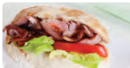
BREAKFAST BLT - $6.90 each Crunchy bacon, lettuce and tomato in a soft roll.