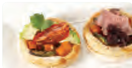
ROAST TARTS - $5.40 each Roast tomato with sticky onion jam or lamb shoulder and red pepper relish.