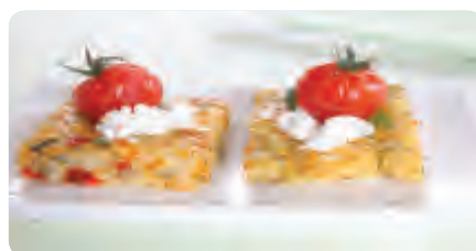
FRESH BAKED FRITTATAS - $5.40 each Ricotta, zucchini and dill frittata with tomato relish and smoked ham or tomato relish, baby spinach and cherry tomatoes. G