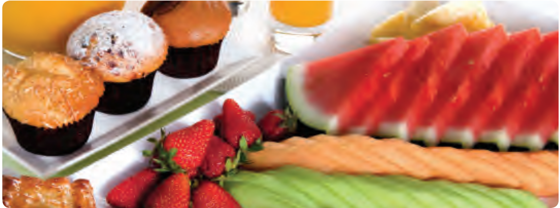
BREAKFAST PACKAGE ONE $12.90 per person Seasonal fruit platter, freshly baked Danish pastries, sweet muffins and orange juice.

Do you have a group for breakfast and want variety? Try a Breakfast Package. Breakfast deliveries begin at 7.00am. A minimum of 6 people applies to each package.