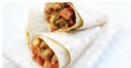
MEXICAN FAJITA - $5.70 each Tender grilled chicken strips with spicy fajita sauce & jalapeno peppers in a tortilla wrap finished with guacamole & sour cream.