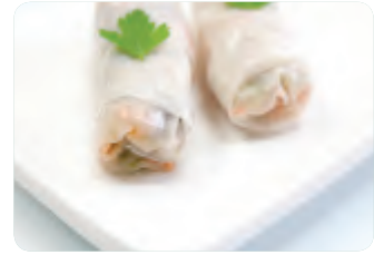
RICE PAPER ROLLS $3.60 each With a mint & chilli infusion served with traditional dipping sauce.