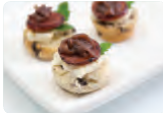
HERB & OLIVE DAMPER - $3.30 each With chorizo sausage and sticky onion chutney.