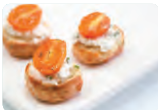
MINI CHEESE & CHIVE SCONES V - $2.90 each With goat's cheese and blistered cherry tomato on top.