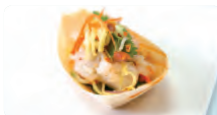
PRAWN SALAD - $7.20 each D G Served in a bamboo boat with green paw paw, peanuts and namjin dressing.