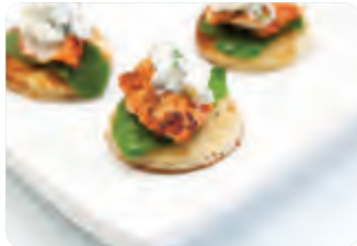
BABY NAAN - $3.30 each Topped with tandoori chicken and raita.