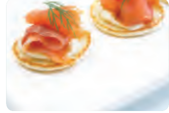
SMOKED SALMON - $3.90 each On a blini with crème fraiche and dill.