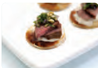
LAMB FILLET - $3.50 each Served on crisp pita with hummus and coriander and pine nut salsa.