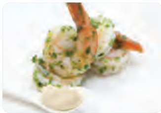
GRILLED PRAWNS $3.50 each G Tossed with finely chopped parsley, garlic & olive oil with a lemon aioli dip.