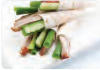
DUCK CREPES - $3.90 each Filled with roasted duck breast, cucumber, spring onion with hoisin sauce.

The most popular way to enjoy cold canapés with your lunch is to serve them alongside sandwiches. We normally recommend 3 cold canapés and one mixed sandwich per person with the addition of cheese and fruit. Minimum of 10 pieces per item applies