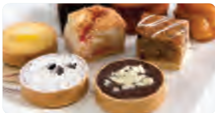
ASSORTED SWEETS - $5.90 per serve A selection from our whole sweets menu including Danish pastries (2 per serve).