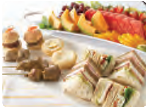
COMBO C - $22.90 per person Includes mixed sandwiches, a selection of hot savouries and a fruit platter.