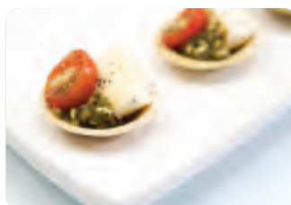
TOMATO TARTLETS V - $3.40 each Crisp tartlet case with cherry tomato, basil and bocconcini.