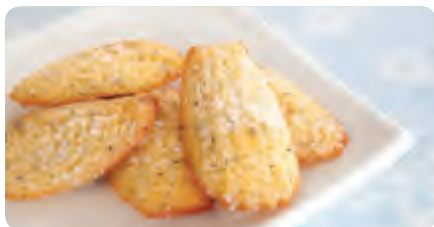
MADELINES - $2.90 per serve Petite sponge cakes in a variety of flavours that may include orange, poppy seed and chocolate (3 per serve).