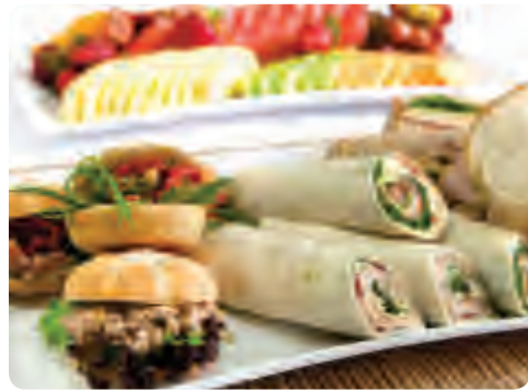
COMBO B - $19.70 per person Includes assorted wraps, Kaiser rolls, panini and a fruit platter.