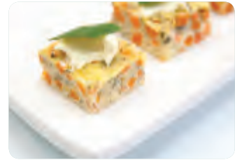
POTATO FRITTATA V G - $2.90 each Sweet potato and sage frittata topped with mint crème fraiche.