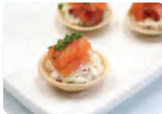
SALMON TARTLET - $3.50 each Crispy tartlet filled with smoked salmon, celeriac remoulade & chives.