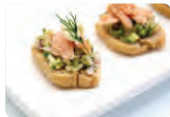
SMOKED TROUT - $3.90 each Served on crostini with avocado and dill salsa.