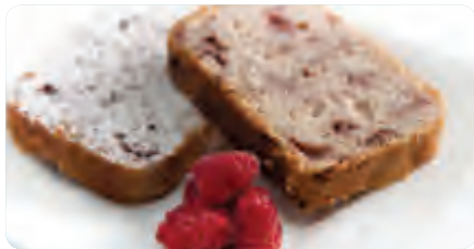
RASPBERRY & COCONUT BREAD - $2.90 each Cut into a thick slice and served with a fruity whipped butter.