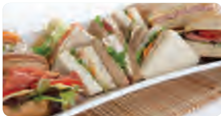
SELECTION PLATTER - $12.70 per person Includes a selection of mixed sandwiches, baguettes and paninis. Minimum order of 6.