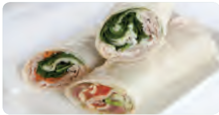
ASSORTED WRAPS $8.50 per wrap Thin roti bread with healthy and delicious fillings, served as two halves. Recommended 1.5 per person.