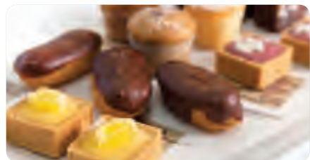
MINI SWEET TREATS - $6.30 per serve A bite sized selection of delicious sweets may include slices, tarts, macarons and muffins (3 per serve).