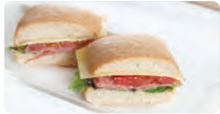
PANINI ROLLS $9.65 per roll An Italian bread roll with a yeasty flavour. Recommended 1 per person.