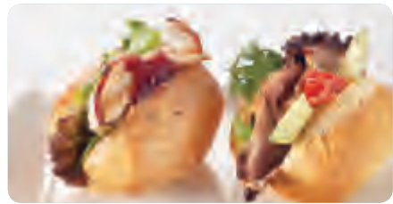
BAGUETTES $6.60 per roll A French style bread roll bursting with our colourful fillings. Recommended 2 per person.