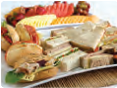
COMBO A - $18.90 per person Includes baguettes, club sandwiches, swiss cobb and a fruit platter.

Take the guess work out with these tasty and colourful plattered and lunch combos. A minimum order for 6 people applies.