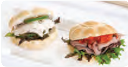
KAISER ROLLS $5.15 per roll A very tasty bread with great presentation. Recommended 2.5 per person.