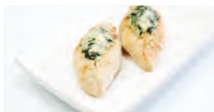
TURKISH PIDE - $5.60 each V Turkish pastry filled with spinach leaves and feta cheese.